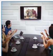
Record Video Conferences