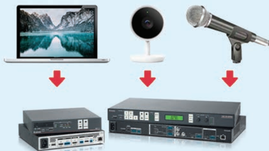
SMP 111 and SMP 300 Series