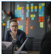
Digital Asset Management