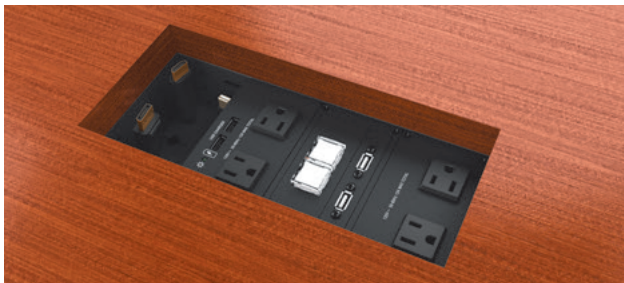
Two or more Cable Cubby 650 UT enclosures can be ganged together for a nearly endless selection of AV connectivity options.

The Cable Cubby 650 UT requires precision table cutting and professional carpentry skills for proper installation.