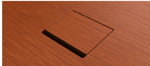
Cable Cubby 650 UT closed – Installed with a professionally-fabricated table-matching lid, it offers a discreet, architecturally-friendly design.