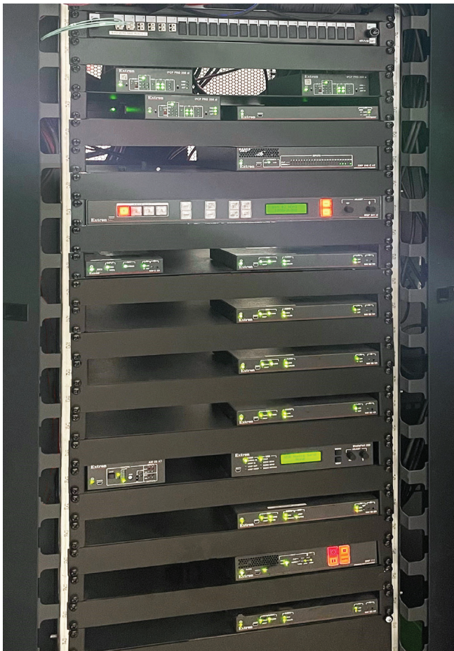
A centralized AV equipment rack houses Extron NAV endpoints and other AV system hardware.

Third, the system had to support 24/7 operation with minimal risk of downtime. In clinical and research settings, the AV infrastructure is often mission-critical. Any failure could compromise a surgical procedure, interrupt a lecture, or block a research demonstration. To reduce this risk, the integrator had to design for full redundancy across all key AV components, while also maintaining low latency and consistent performance under heavy load.