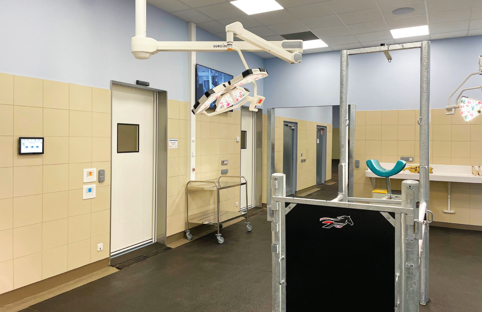
A wall-mounted TouchLink® Pro touchpanel in an exam room provides intuitive AV system control during clinical teaching sessions.

“Designing a campus-wide AV system for continuous clinical use required a solution that combined reliability, flexibility, and intuitive control. With Extron’s NAV platform, we delivered a high-performance infrastructure that supports everything from live surgeries to collaborative research, all within a secure, scalable framework.”