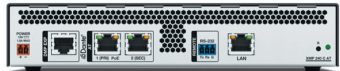
Back - XMP 240 C AT